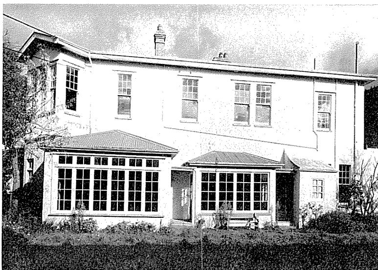
WELLINGTON KINDERGARTEN TEACHERS' COLLEGE, 112 TINAKORI ROAD, WELLINGTON.