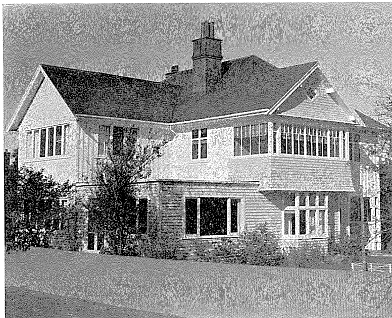
CHRISTCHURCH KINDERGARTEN TEACHERS' COLLEGE, 80 PARK TERRACE, CHRISTCHURCH.