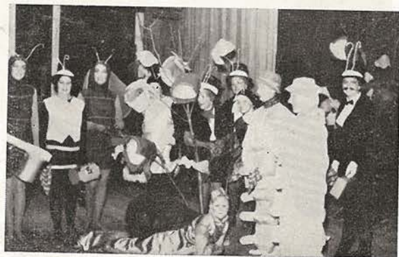
EAST HARBOUR 1963