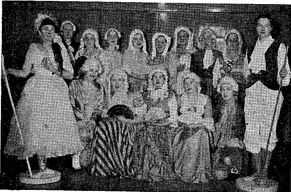
MIRAMAR NORTH KINDERGARTEN 1955—"RENDEZVOUS."