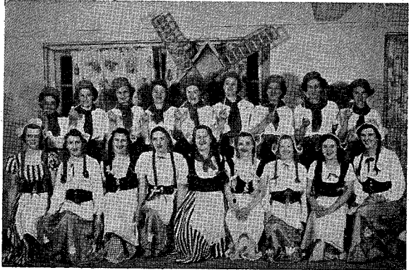
PETONE 1953—"TULIP TIME."