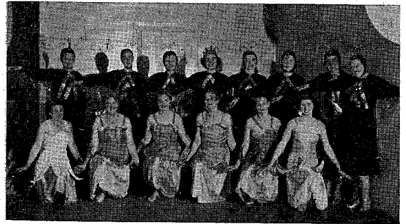
KHANDALLAH KINDERGARTEN 1955.