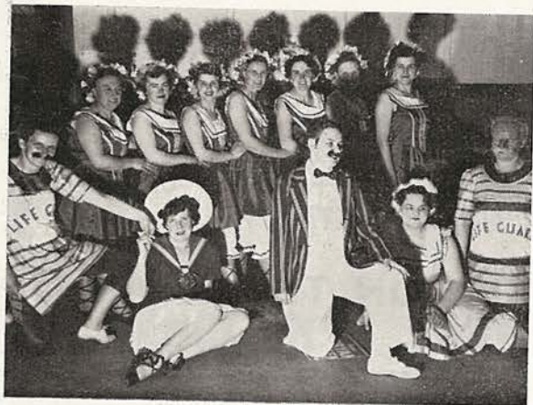
WELLINGTON SOUTH 1951

We feel that during the war years and those years following when very few overseas shows were available, that we filled a real need to the public in providing bright entertainment at a very reasonable cost and to all performers and supporters who have faithfully attended for many years especially the mothers from the Masterton United Mothers' Club, who have attended every year since 1954, we say a big thank you and hope that you enjoy our Silver Jubilee show as much as you have enjoyed the past 24.