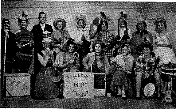
LYALL BAY 1958.