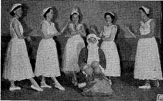
ISLAND BAY FREE KINDERGARTEN - 1956.