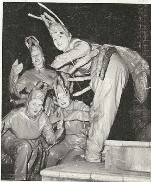
NGAIO KINDERGARTEN 1958.