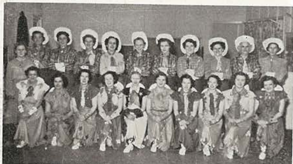
NEWTOWN TALENTS 1952—"ANNIE GET YOUR GUN."