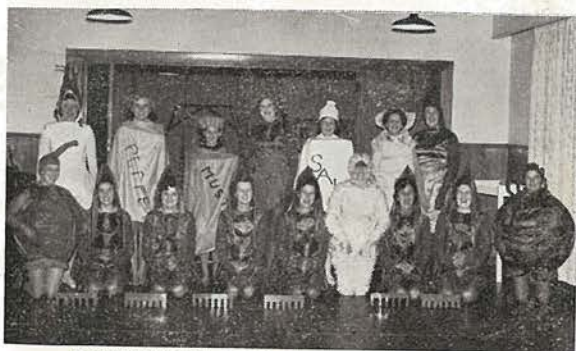
STRATHMORE PARK 1959—"SALAD DAZE."