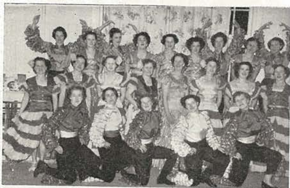
BERHAMPORE 1955—"DOWN IN THE CARRIBEAN."