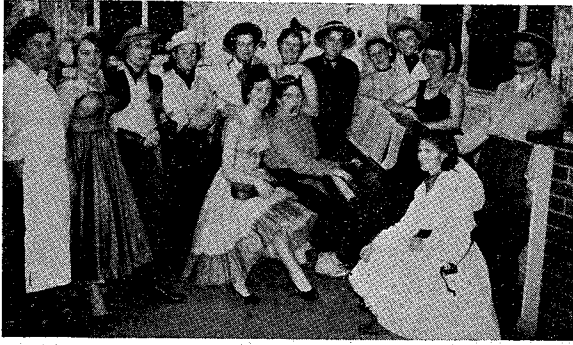
MIRAMAR CLUB 1960—"FRANKIE AND JOHNNIE."