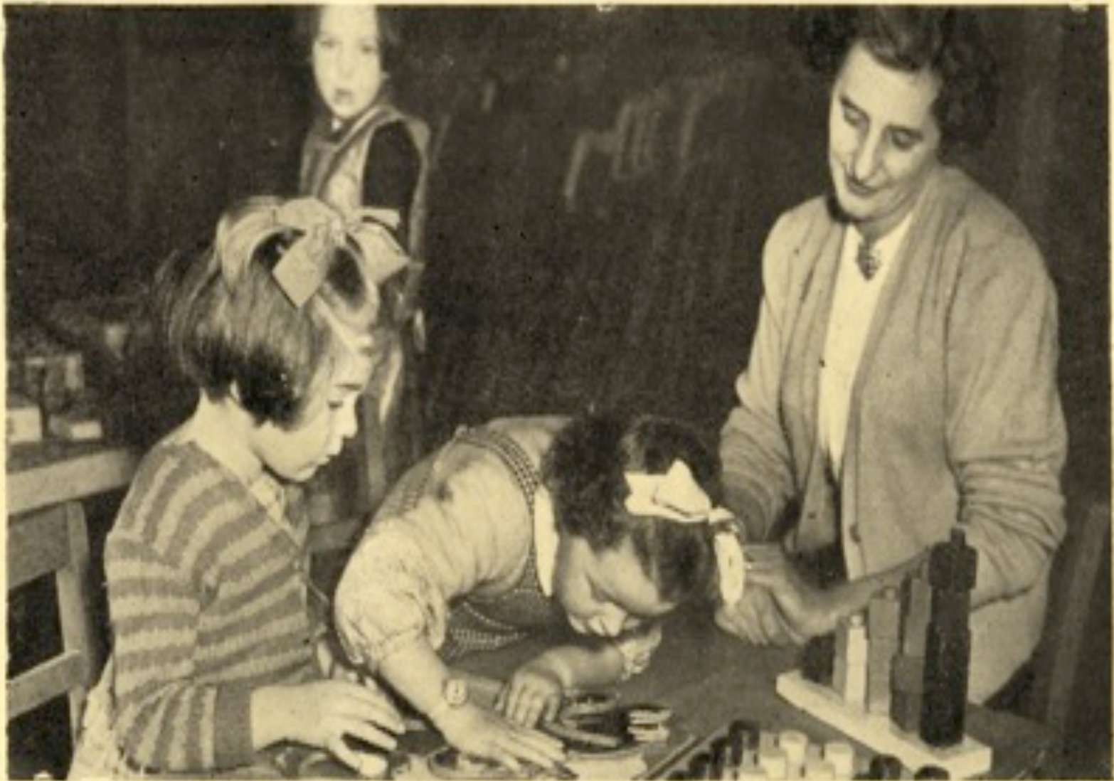
A mother in Kindergarten watches, assists, and learns.