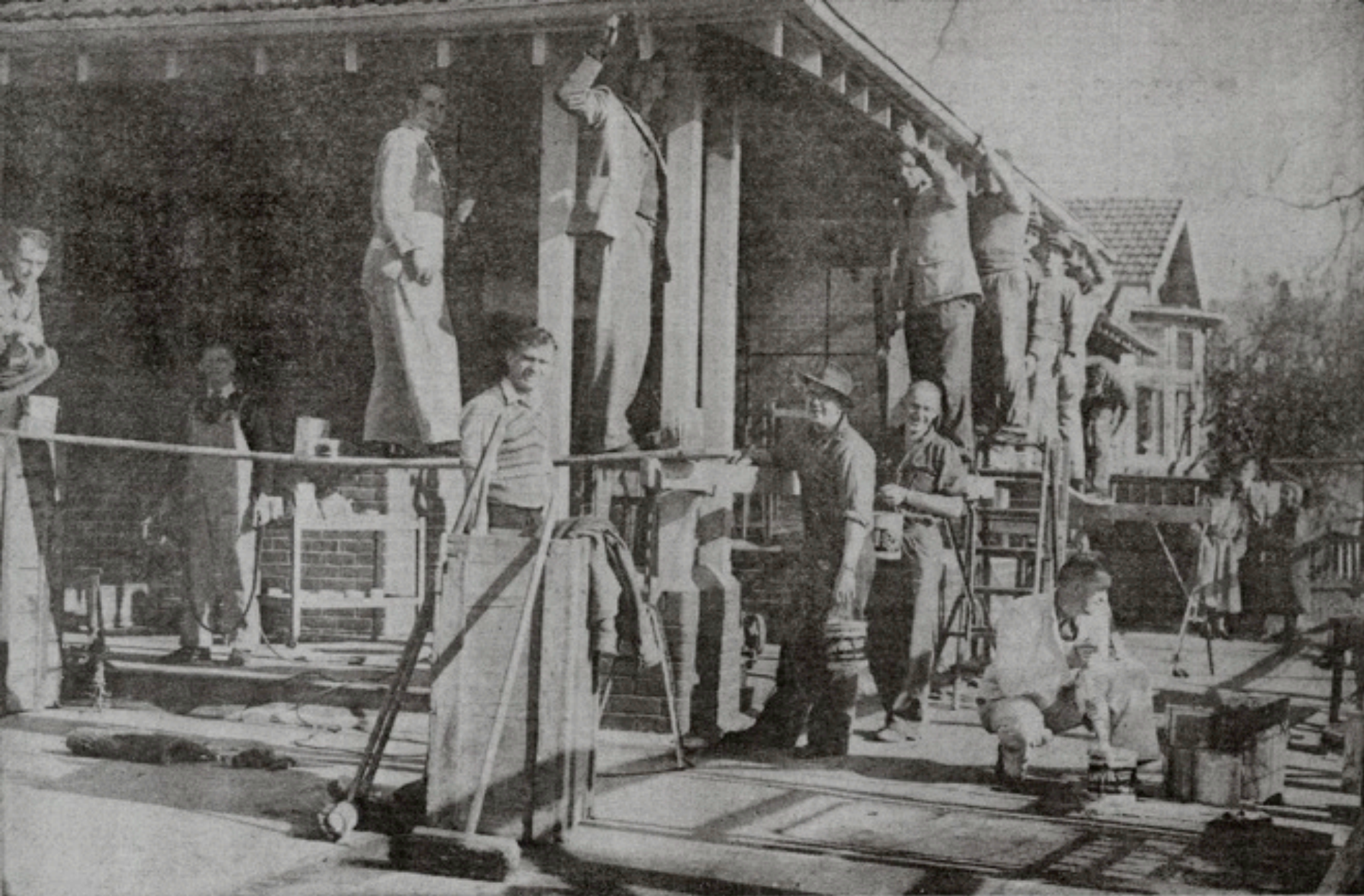
FATHERS' DAY at the Kelsey-Yaralla Kindergarten on Saturday, August 22, 1953, as the men painted the exterior of the building in preparation for the New Zealand Kindergarten Association conference held there later that year.

Fathers day at Kelsey Yarella Kindergarten, 22 August 1953, DKA MD-2709/21, Hocken Collections – Uare Takoka o Hākena, University of Otago