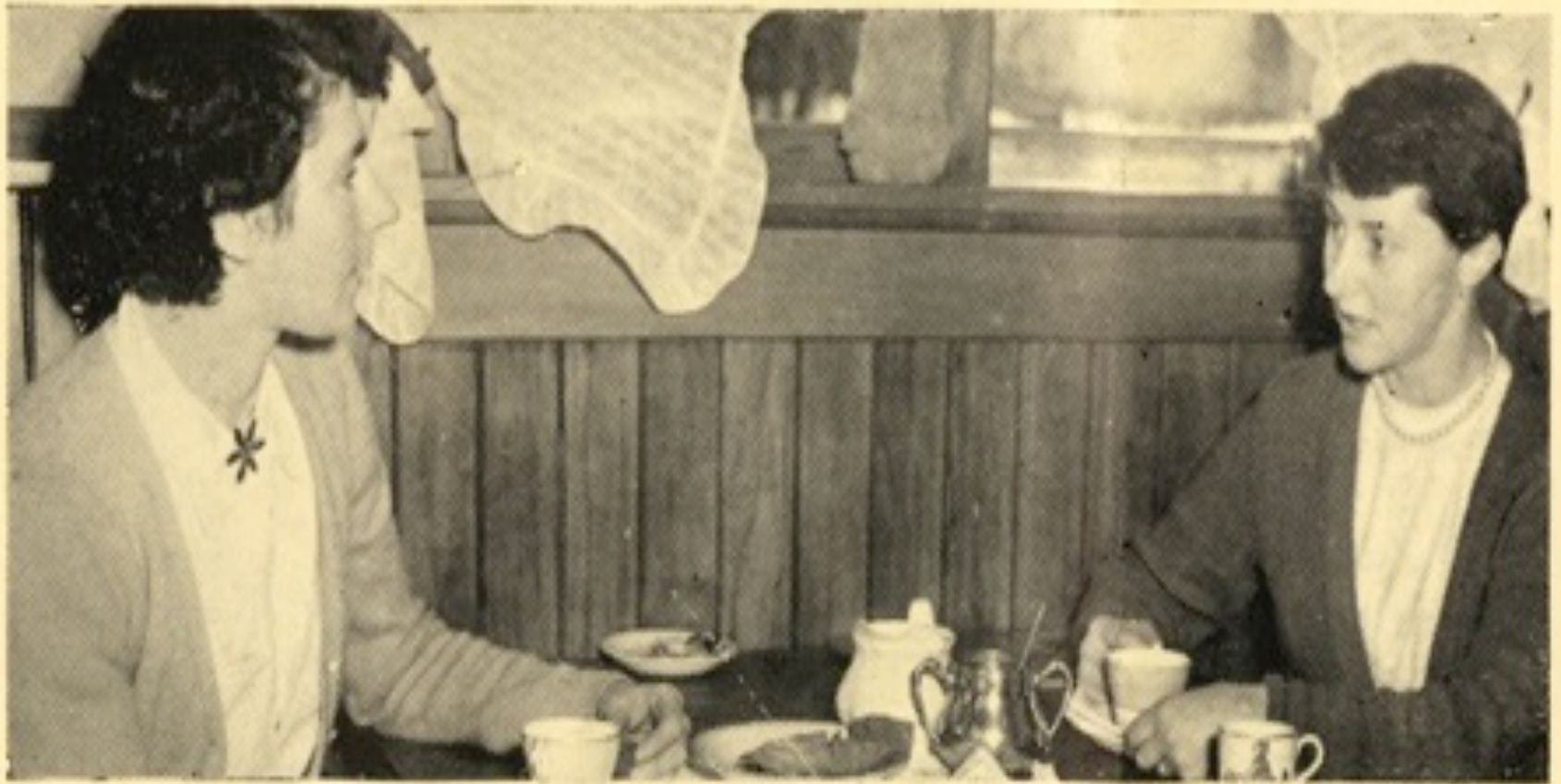
The Kindergarten teacher visits the Home. A better understanding of the child is gained.