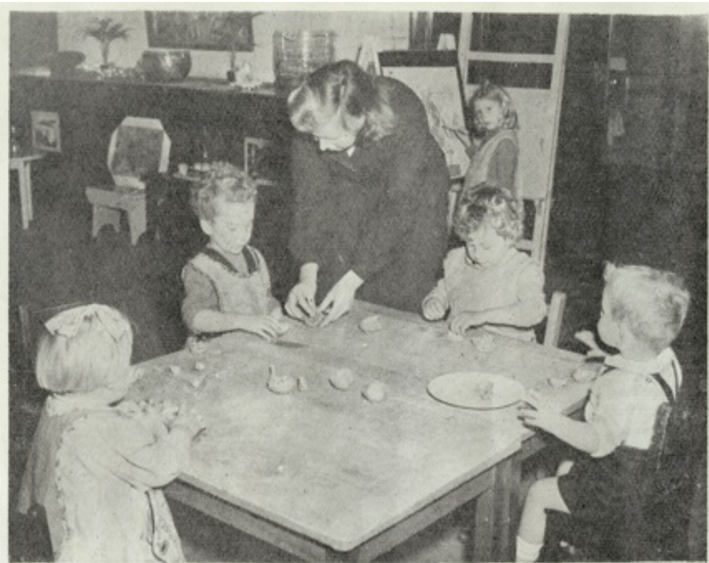
A mother helper at afternoon Kindergarten. The children enjoy squeezing, pounding, and moulding the potters' clay.