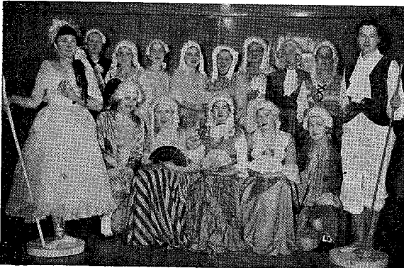
MIRAMAR NORTH KINDERGARTEN 1955—"RENDEZVOUS."