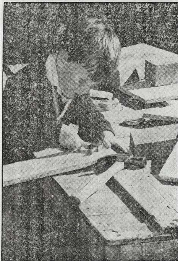
The kindergarten teacher provides a programme of stimulating and varied activities for both indoors and outdoors.

For those keen on taking up this career the Free Kindergarten Association offers a two-year course in its training colleges at Auckland, Wellington, Christchurch and Dunedin.