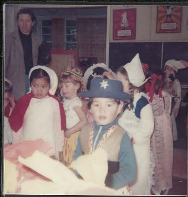
Fancy dress 1973

This being all the meeting closed at 9 o'clock.