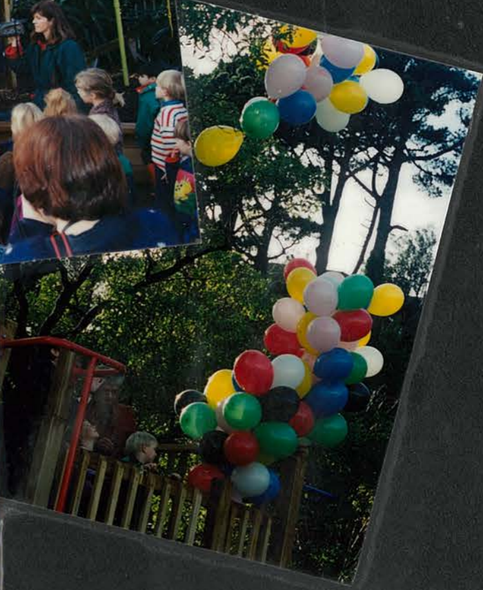
1994. Planning, Fundraising, Building and Celebrating! The Tree House arrives.