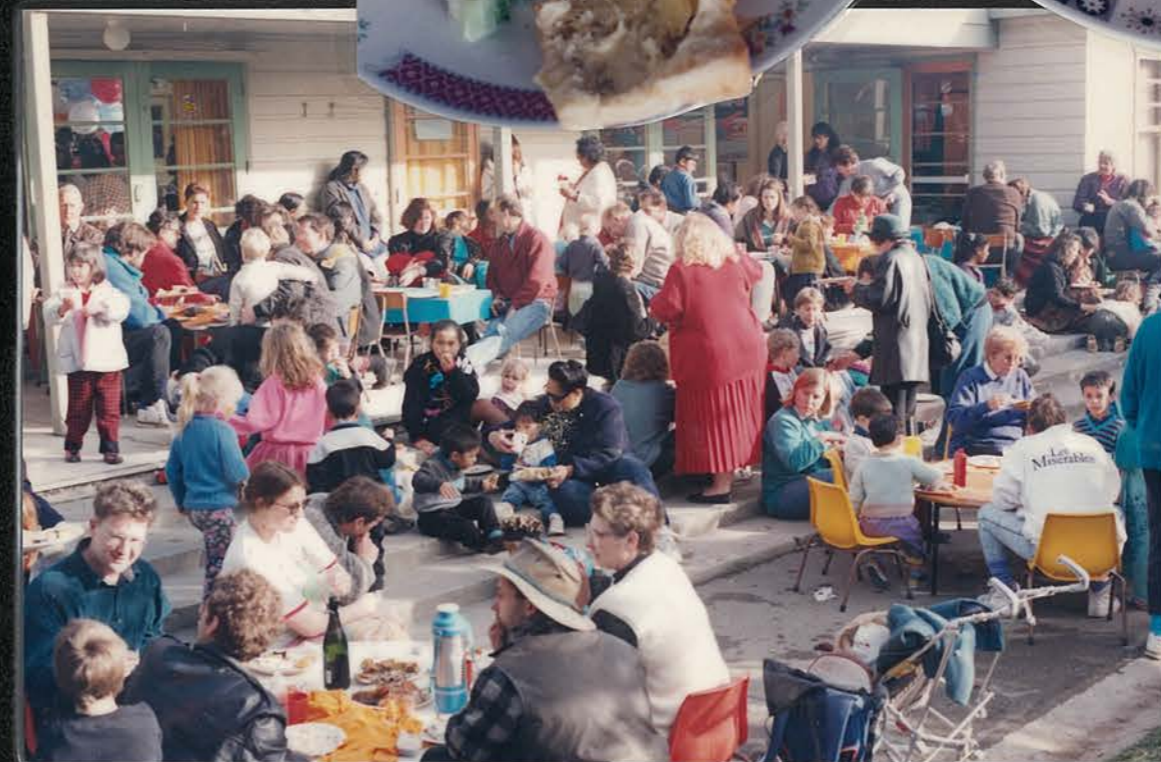
Ethnic Food Fair 1992