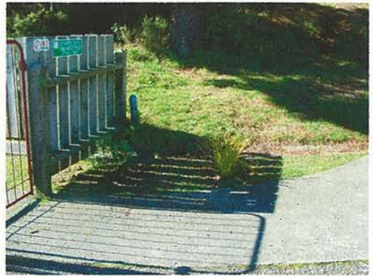
The planted Cabbage tree.