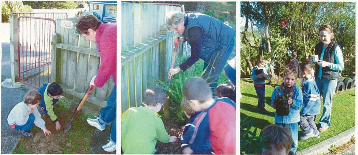
Teachers and Parents assisted the children where necessary.

We held a morning tea party to celebrate the centenary and during that morning planted our cabbage tree in front of the kindergarten. We planted the cabbage tree and several other plants donated to us by the City Council. We planted them in a grassed area in front of our front fence. Children bought along party food and because the weather was so good they were able to have their party outside on the deck. Children were given a balloon and sticker at the party.