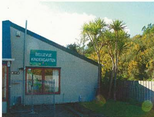
We hope it will grow like our other Cabbage trees.