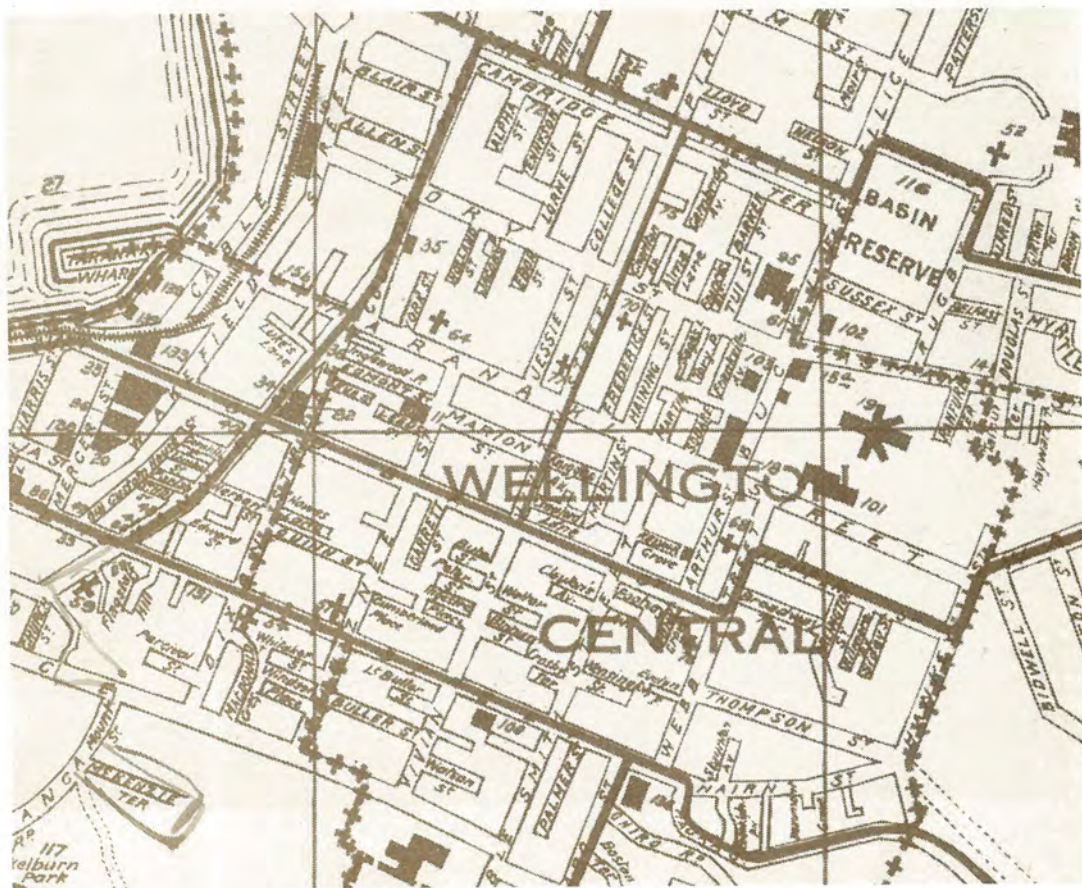
A map of the period. Taranaki Street is in the centre.

kindergarten. We didn't have the books that there are today and we were trained to tell stories that we had learnt by heart. The children had their favourites. You could tell "The Three Bears" every day. When it was time to go home the children stood in a circle and sang. There was a Union Jack and the children sang God Save the King and said: