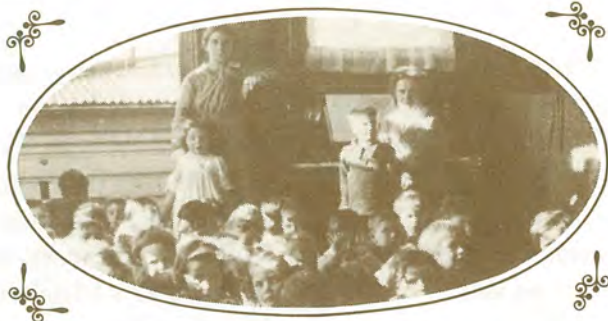
The interior of the old Taranaki Street Kindergarten, 1918.