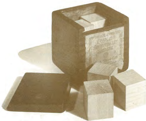
The third gift and its little wooden box.

in little wooden boxes with sliding lids. We sat at long tables, about a dozen children and a teacher, and we had a tray with all these little boxes, and before the children played with them they had to be passed around. The teacher would place her hands around the first box and pass it to the child beside her. He would put his hands round it and pass it on to the next child and so on until the last child was reached. By the time the boxes had been passed right round the table the children would be fed up because they were not doing anything. The third gift consisted of eight blocks which together formed a two