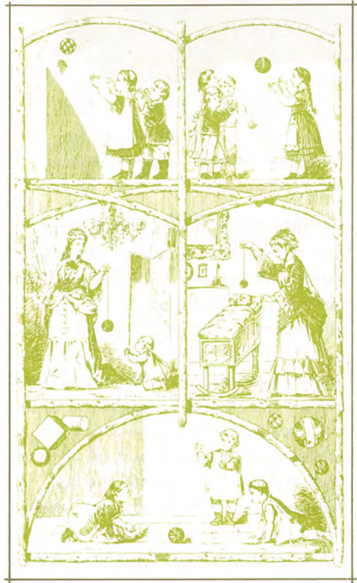
Froebel intended the first gift, the ball, to be used in the nursery.

The second gift came in a long box in which were a sphere, a cube, a cylinder, and rods and standards. We used to twirl these objects around. Just demonstrate them. The gifts that the children really started with were