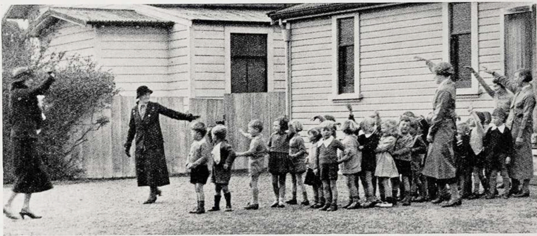
HASTINGS KINDERGARTEN CHILDREN RECEIVE A VICE-REGAL VISITOR.