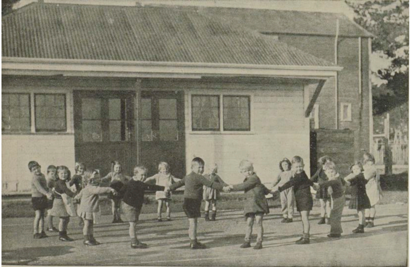
KINDERGARTEN SPONSORED BY AERO CLUB OPENED IN HOKITIKA