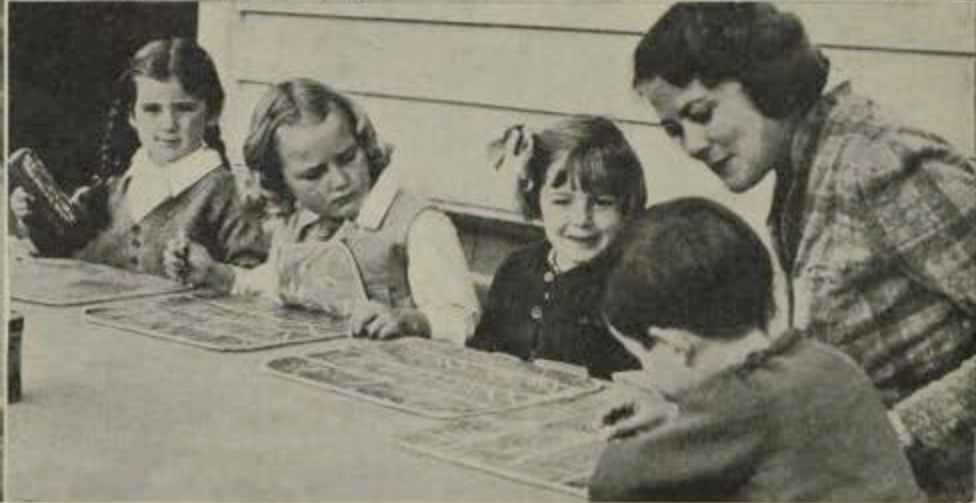
FIRST STEPS TO SCHOOL: SMALL BOYS AND GIRLS LEARN THEIR LETTERS AT AN AUCKLAND KINDERGARTEN