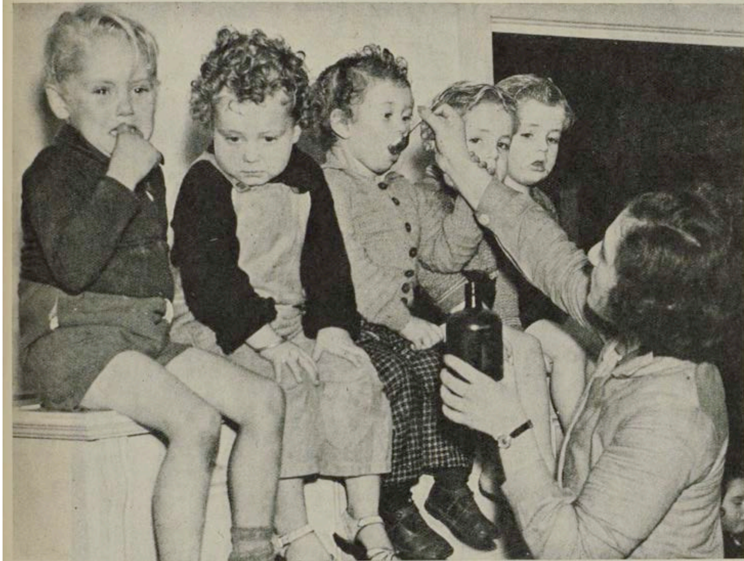
MEDICINE TIME IN THE KINDERGARTEN