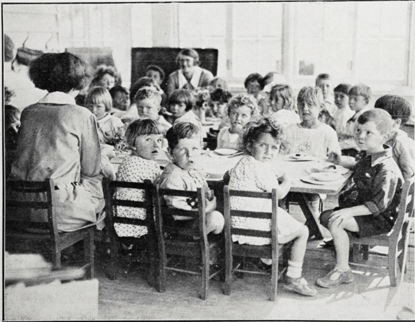
HAPPY LITTLE TOTS IN WELLINGTON'S FIRST PUBLIC KINDERGARTEN, RECENTLY OPENED AT BERGHAMPORE.