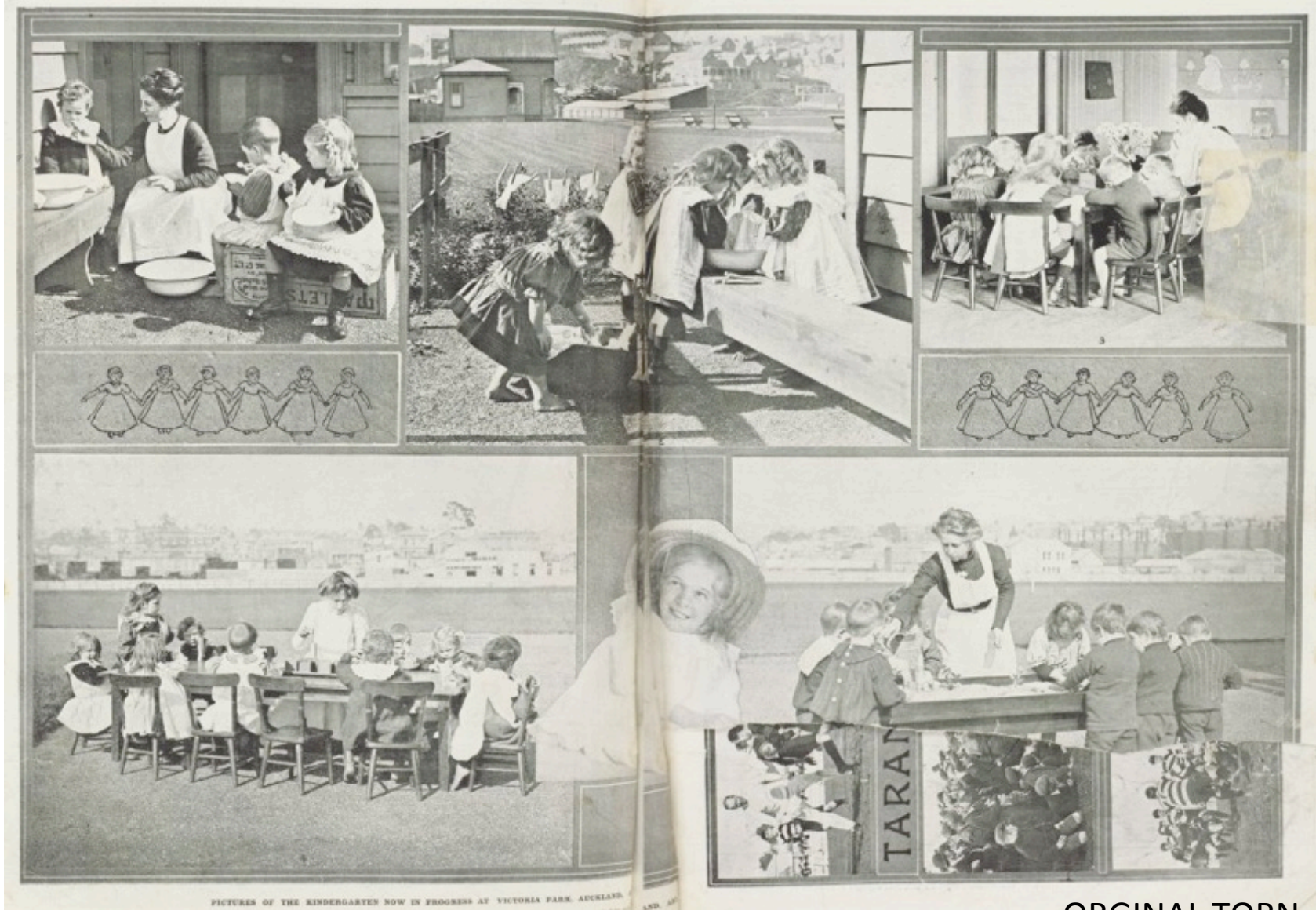
PICTURES OF THE KINDERGARTEN NOW IN PROGRESS AT VICTORIA PARK, AUCKLAND.