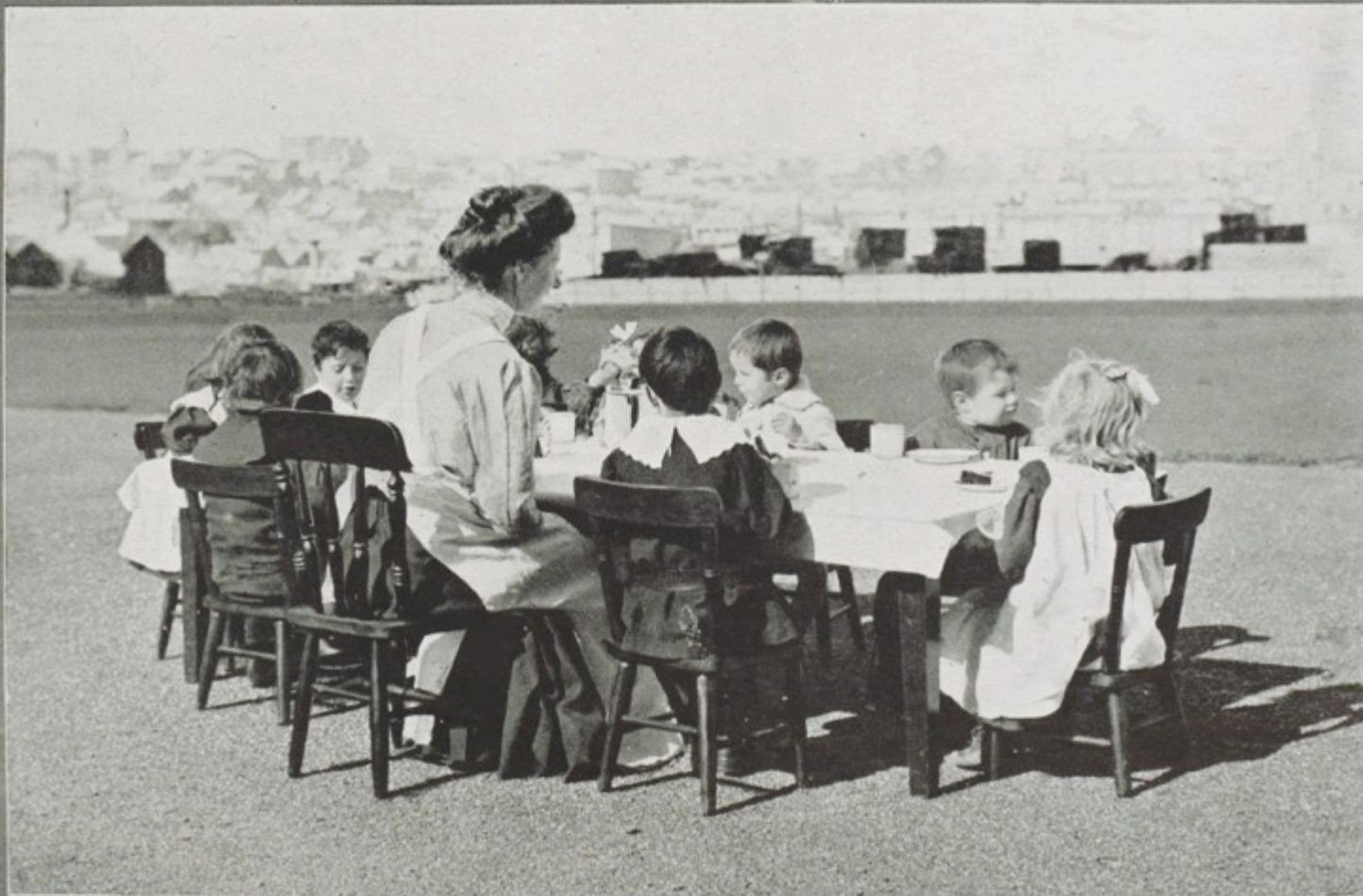
MORNING TEA—A KINDERGARTEN STUDY FROM VICTORIA PARK, AUCKLAND.