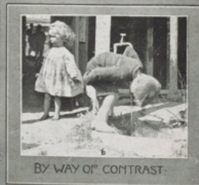
BY WAY OF CONTRAST.