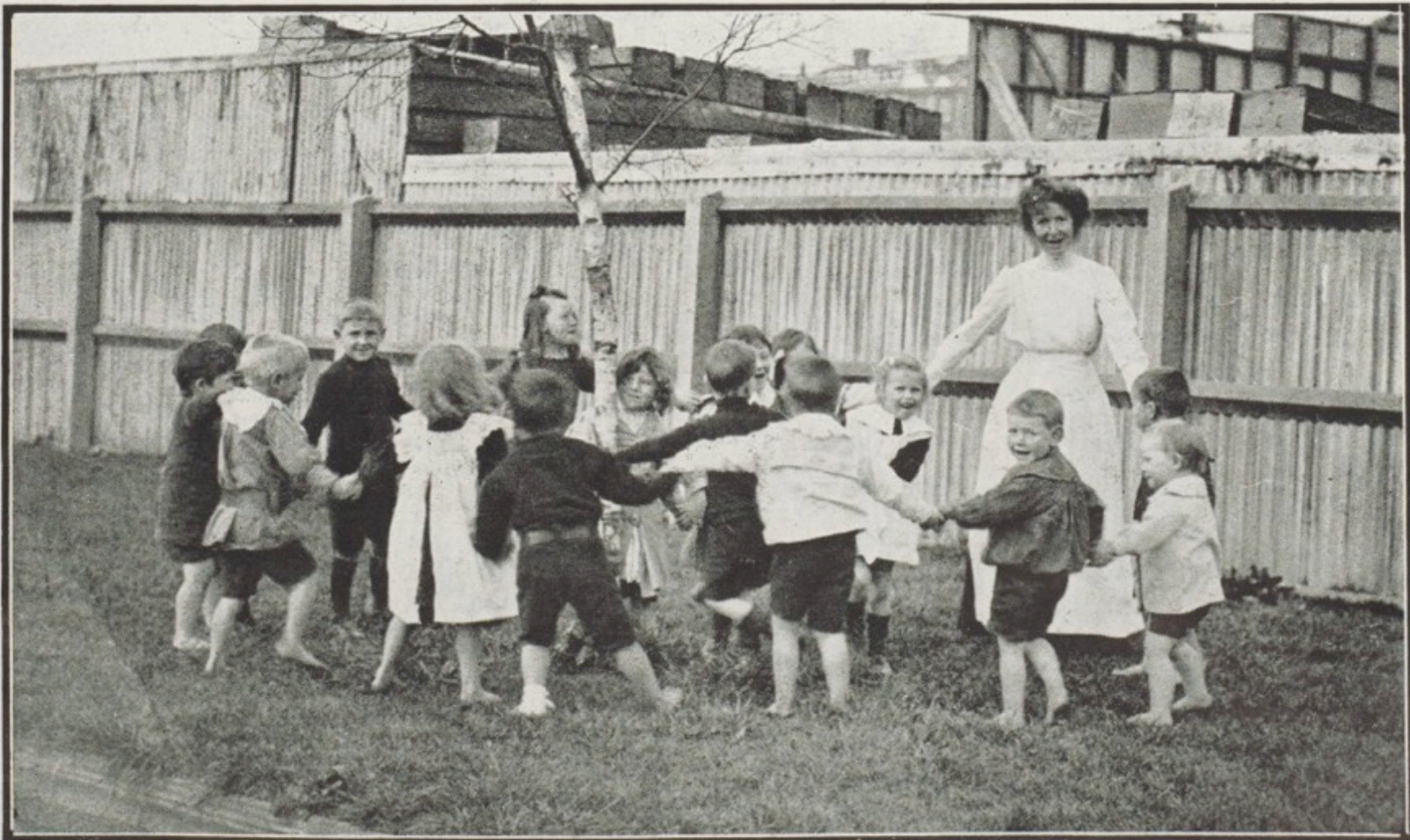
FRESH AIR AND GAMES PROVIDED FOR CHILDREN AT THE AUCKLAND FREE KINDERGARTEN, AND WHICH IS DENIED THEM IN THE POORER HOUSING DISTRICTS OF THE CITY.