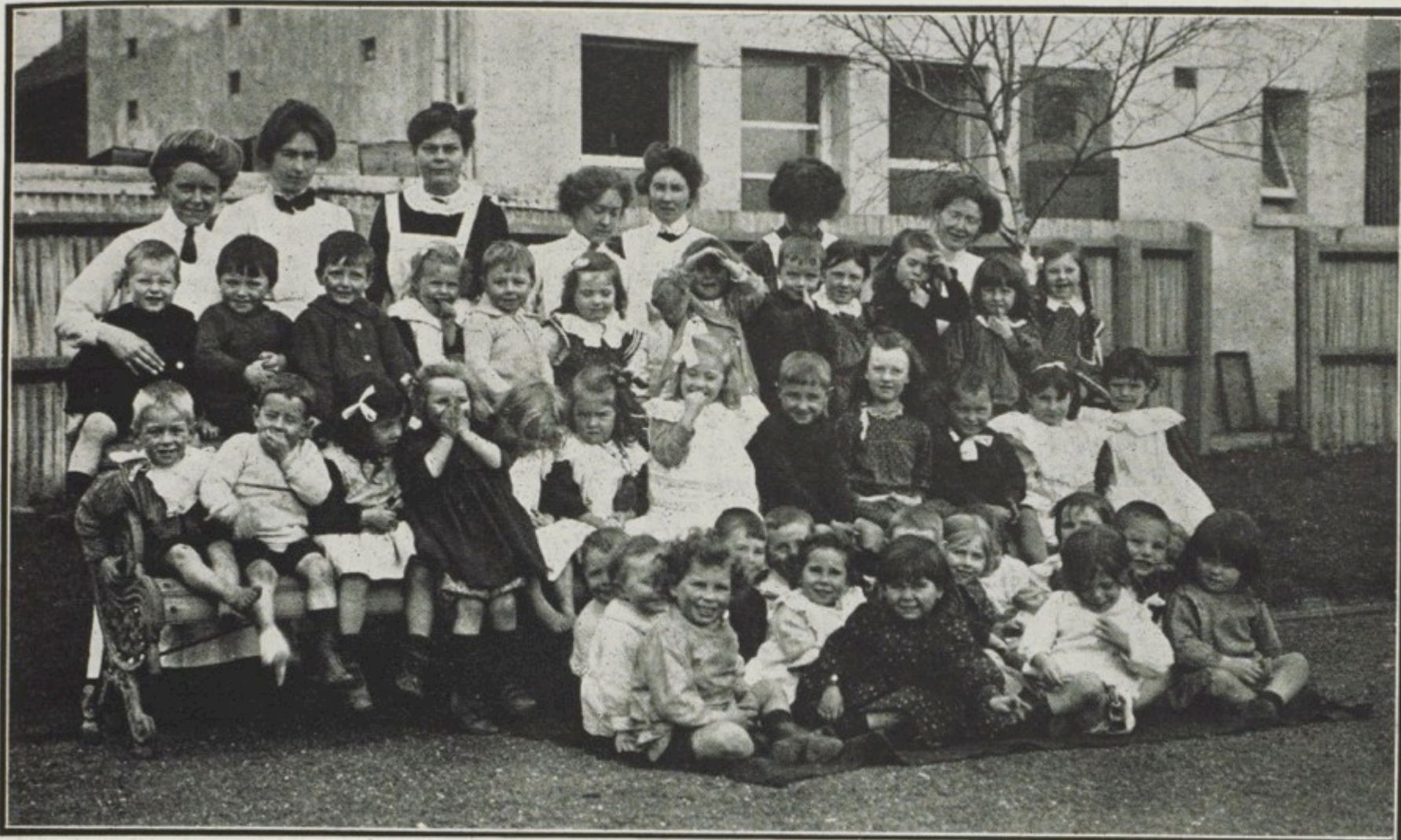
SOME OF THE ACTIVE PARTICIPANTS IN THE ADVANTAGES OFFERED AT THE AUCKLAND CAMPBELL-LEE FREE KINDERGARTEN.