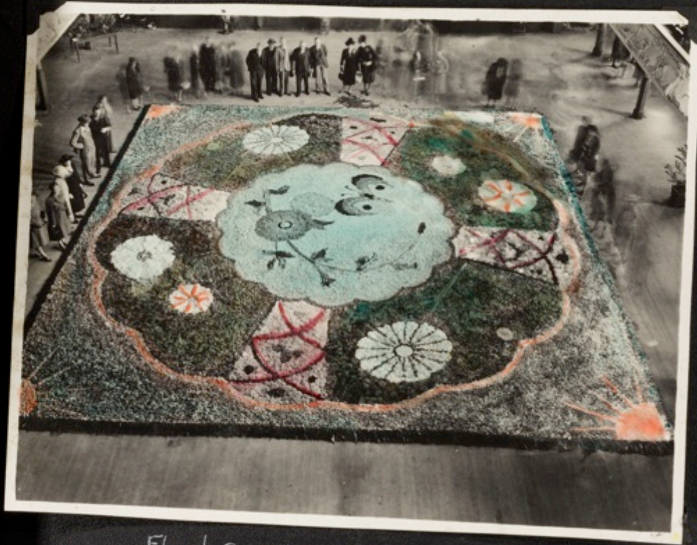
Floral Carpet. Town Hall. April. 1947.