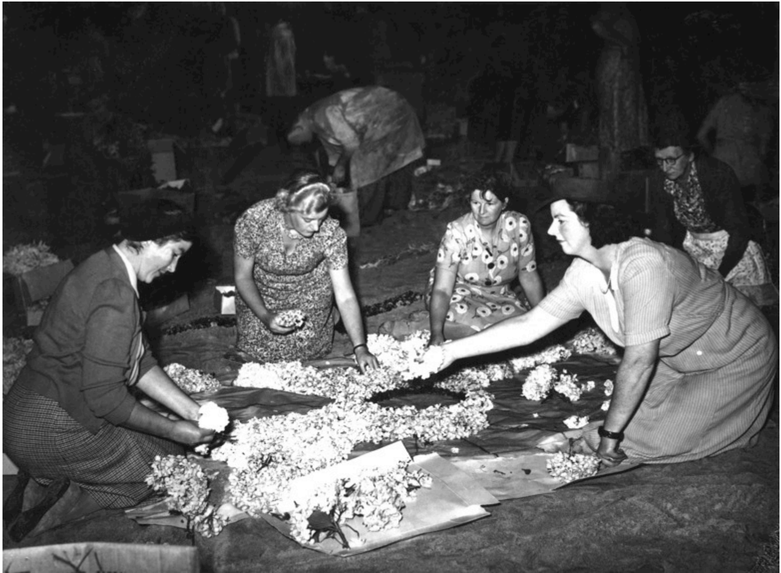
Kindergarten students assisting in the preparation of a floral carpet, Undated, AKA, Grey Collections, Auckland Public Library