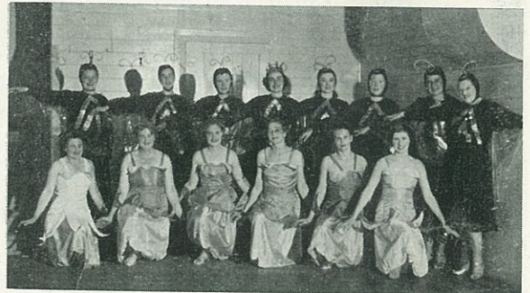
KHANDALLAH KINDERGARTEN 1955.