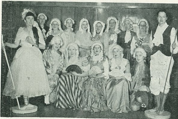
MIRAMAR NORTH KINDERGARTEN 1955— "RENDEZVOUS."