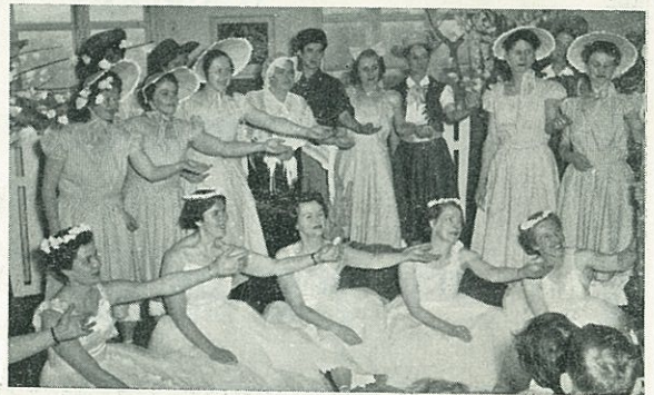
HATAITAI 1955—"JOHNNIE APPLESEED."