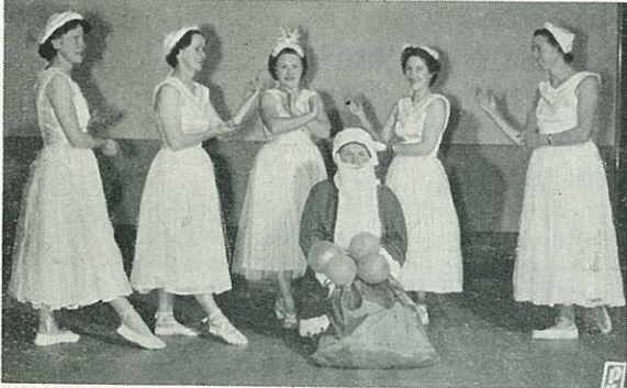
ISLAND BAY FREE KINDERGARTEN 1956.