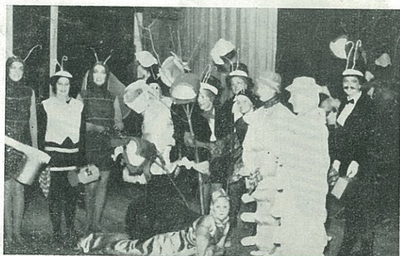
EAST HARBOUR 1963