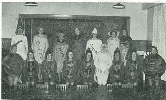
STRATHMORE PARK 1959—"SALAD DAZE."