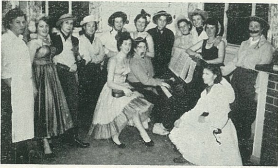
MIRAMAR CLUB 1960—"FRANKIE AND JOHNNIE."