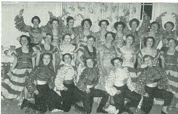
BERHAMPORE 1955—"DOWN IN THE CARRIBEAN."