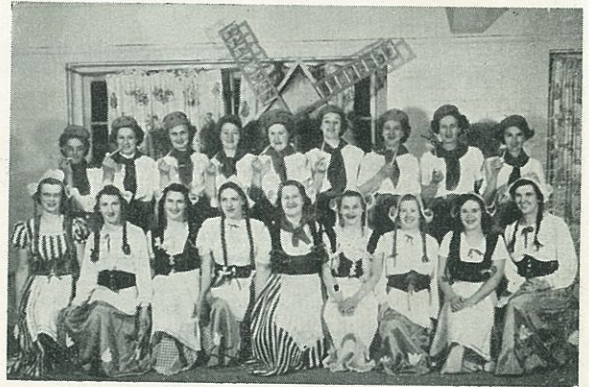
PETONE 1953—"TULIP TIME."