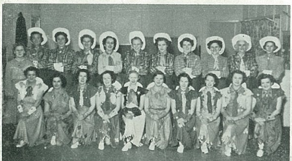
NEWTOWN TALENTS 1952—"ANNIE GET YOUR GUN."