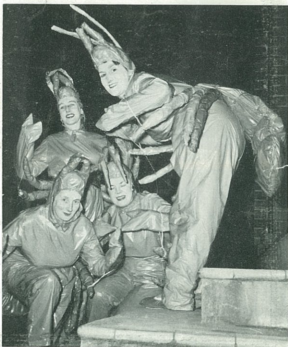
NGAIO KINDERGARTEN 1958.