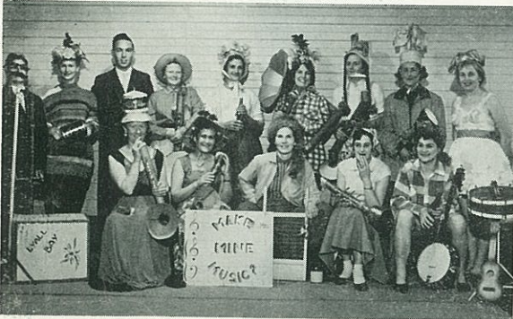
LYALL BAY 1958.