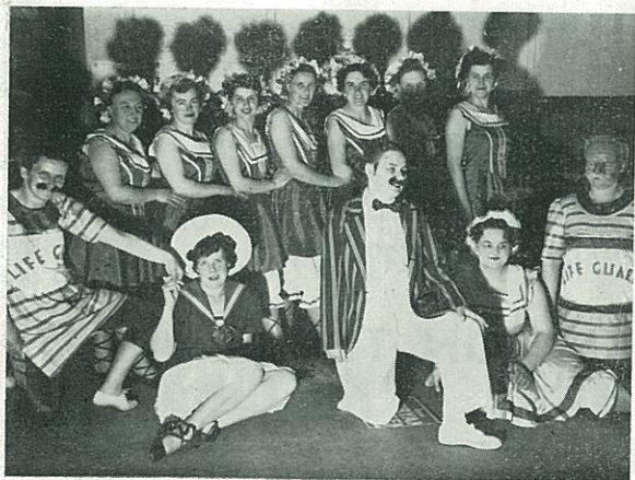
WELLINGTON SOUTH 1951

We feel that during the war years and those years following when very few overseas shows were available, that we filled a real need to the public in providing bright entertainment at a very reasonable cost and to all performers and supporters who have faithfully attended for many years especially the mothers from the Masterton United Mothers' Club, who have attended every year since 1954, we say a big thank you and hope that you enjoy our Silver Jubilee show as much as you have enjoyed the past 24.